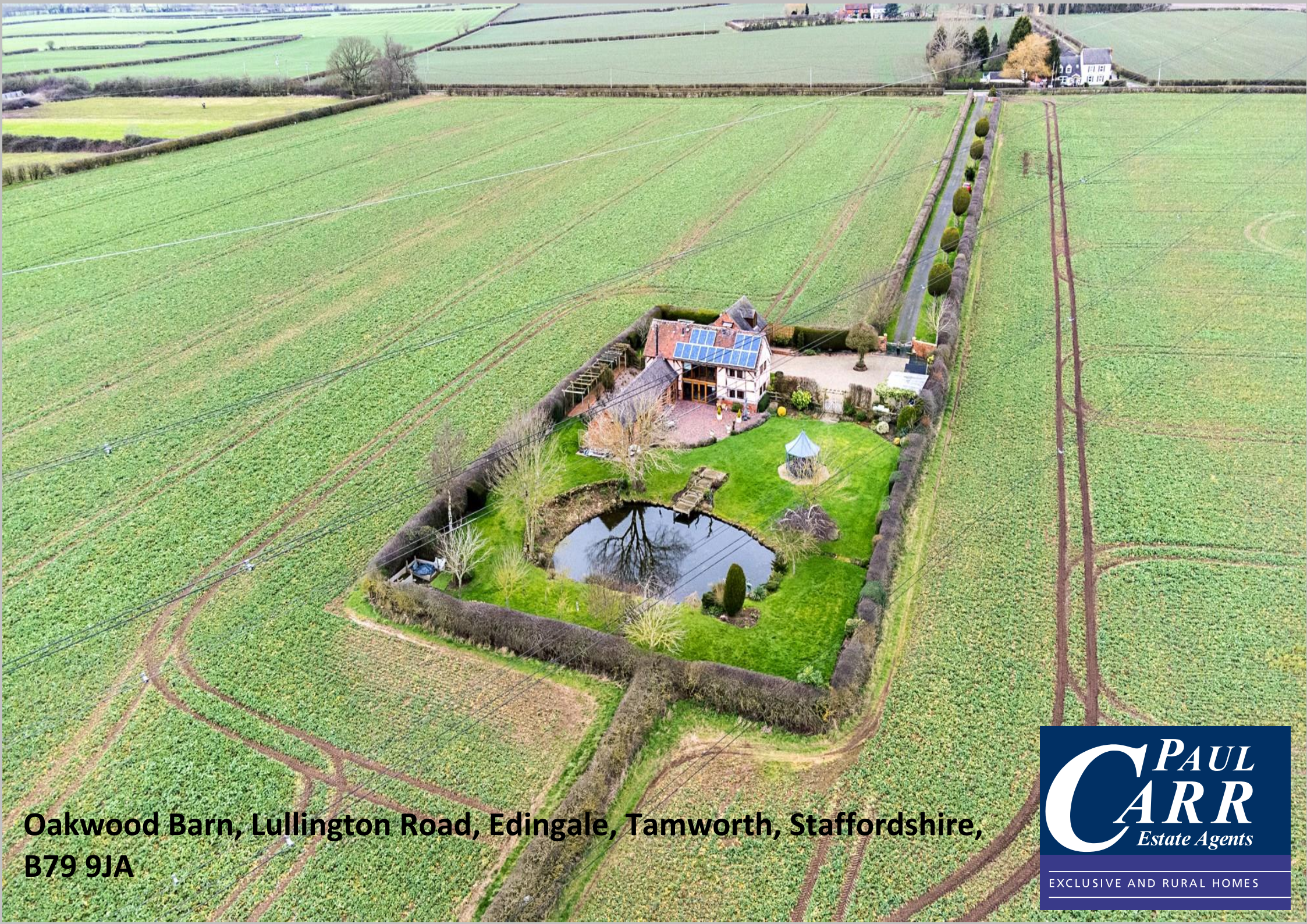
Oakwood Barn, Lullington Road, Edingale, Tamworth, Staffordshire, B79 9JA